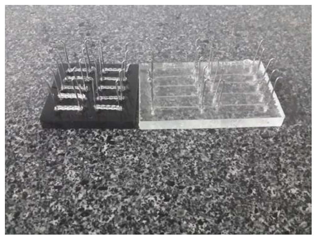
Figure 1. Plastic blocks with stainless steel pins (a). Digital force gauge and its stand (b).

In the case of artificial saliva, the samples were immersed in artificial saliva solution and stored in an