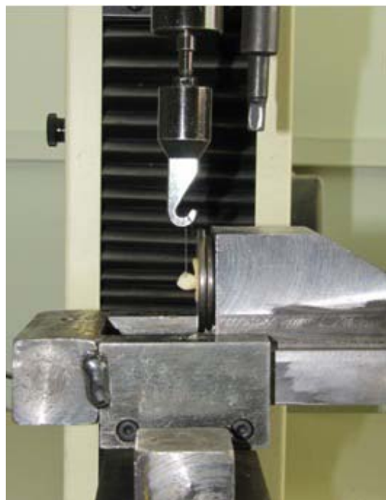
Figure 2. Universal testing machine and tensile failure load test.

Furthermore, the present study confirms previous findings that the use of \text{Al}_2\text{O}_3 air-abrasion followed by the application of phosphate monomer-based primers or resin cement produces more reliable results. 23-27 Some studies have reported high surface roughness and formation of longer tags with \text{Al}_2\text{O}_3 particles. 28-30 Increasing the surface roughness and bonding surface area leads to improved wetting behavior of adhesives. 19,31-33 Air abrasion with \text{Al}_2\text{O}_3 particles is the surface treatment that causes micro-retentive features. 34 In the morphological analysis of the enamel surface, Katora et al 35 observed that the