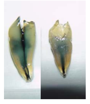
Figure 3. C-shaped canals in mandibular first premolars.