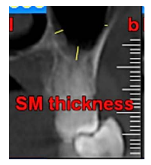
Figure 4. the thickness of the schneiderian membrane

the parameters of the present study were analyzed with Tukey test and ANOVA. In addition, Pearson's correlation coefficient was used to analyze the relationship between the two variables. Furthermore, regression analysis was used to analyze the relationships between the variables.