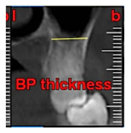
Figure 2. the buccopalatal thickness in the area superior to the apex of the first molar

SPSS 22 was used for the analysis of data, with Pearson's correlation coefficient, Tukey test and regression analysis. Intra-group differences between