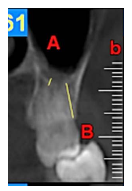
Figure 1. A, the distance between the maxillary sinus floor and the nearest apex of the root of the first molar. B, the distance between the nearest alveolar crest of the first molar on the buccal or lingual aspect.

the nearest apex of the root of the first molar (Figure 1, A) and the nearest alveolar crest of the first molar on the buccal or lingual aspect (Figure 1, B). Furthermore, the buccopalatal thickness in the area superior to the apex of the first molar was determined in the coronal dimension (Figure 2). In the next stage, a line was drawn perpendicular to the line connecting the palatal crests of the first molars on both sides in order to measure the depth of the palate (Figure 3). Finally, the thickness of the schneiderian membrane was determined at three regions of the maxilla: medial, lateral and inferior. Then the mean of the 3 values was used as a reference (Figure 4).