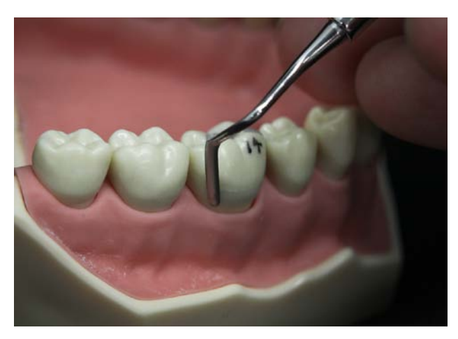
Figure 7. GTI: GTI/glass-ionomer use.

tal student. Total procedural time was recorded for each restoration.