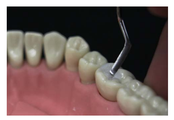
Figure 6. GTI: GTI/composite use.