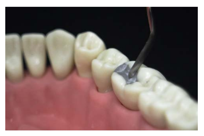
Figure 5. GTI: GTI/amalgam use.