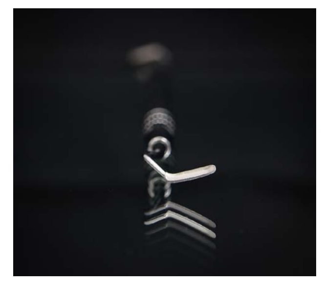
Figure 3. GTI instrument: End view II.

Forty Class II mesio-occlusal or disto-occlusal and twenty buccal Class V preparations were drilled on mandibular first molar dentoform teeth. Ten amalgam (Permite, SDI: Itasca, Illinois) restorations were placed and carved using standard instrumentation (Figure 4) (Table 1). Ten amalgam restorations were placed and carved using the GTI (Figure 5). Ten composite (Filtek Supreme, 3M ESPE: Maplewood, Minnesota) restorations were placed and shaped using standard instrumentation. Ten composite restorations were placed and shaped using the GTI (Figure 6). Ten Fuji IX (GC America: Bongo, Japan) restorations were placed and shaped using standard instrumentation. Ten Fuji IX restorations were placed and shaped using the GTI (Figure 7). All preparations and restorations were completed by a first-year den-