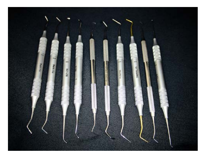
Figure 4. Standard instrumentation.