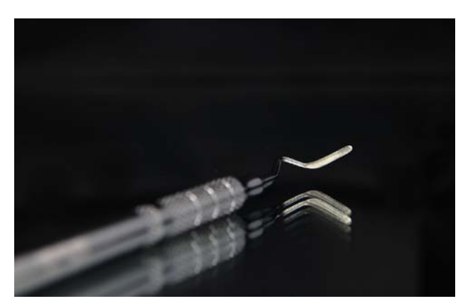
Figure 2. GT instrument: End view I. JODDD, Vol. 11, No. 3 Summer 2017

teeth and three restorative materials: amalgam, composite and glass-ionomer. Procedural time and quality of the restoration were recorded.