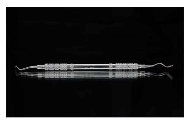
Figure 1. GTI instrument: Full view.

The functionality of the GTI was assessed in a preliminary laboratory study using plastic dentoform