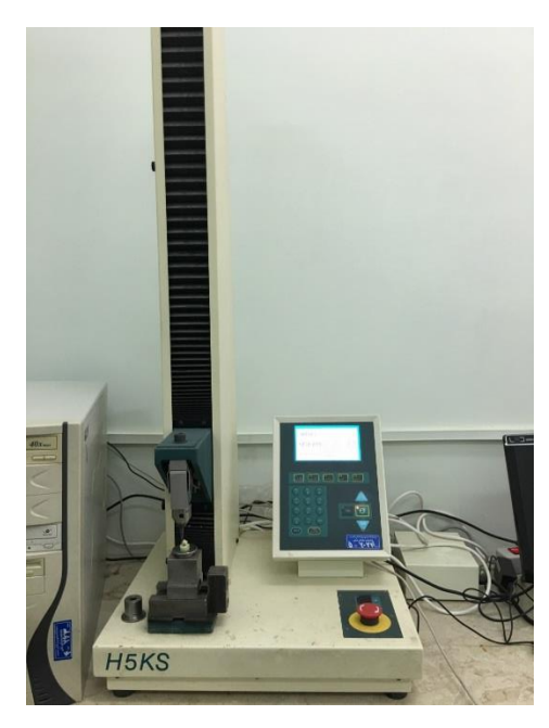
Figure 5. Universal testing machine.

Kolmogorov-Smirnov test was applied to evaluate normal distribution of data. For evaluation of ARI score differences between the two groups, chi-squared test was used. The number of cracks in each group before bonding and after debonding was compared using Wilcoxon test. Mann-Whitney U test was used to compare the number of cracks between the two groups. ANCOVA was used for crack length comparison after and before debonding in each group and