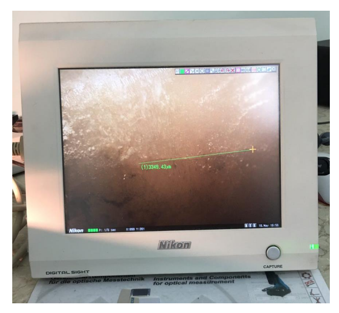
Figure 4. Crack length determination using optical stereomicroscope and digital camera.

H5K-S model, England) at a crosshead speed of 1 mm/min for debonding the brackets (Figure 5).<sup>21,22</sup>