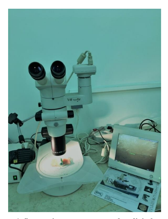
Figure 1. Stereomicroscope connected to digital camera.

All 88 sampleswere examined under an optical stereomicroscope (Nikon, Japan) at ×40, connected to a digital camera (Nikon, Japan) (Figure 1) with the ability of linear measurements for evaluation of the number and length of primary enamel cracks. All the teeth