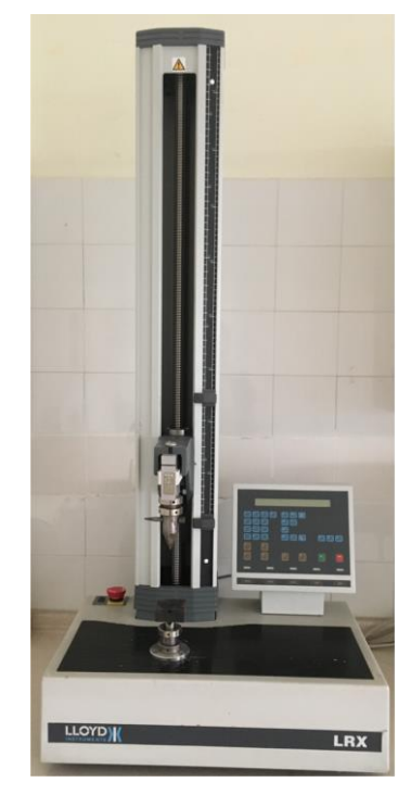
Figure 1. The push-out testing device.

Wallis and post hoc Dunn tests. All the analyzes were performed using SPPS 21 (IBM-SPSS Inc., Chicago, IL, USA) software, and the statistical significance was set at 5%.