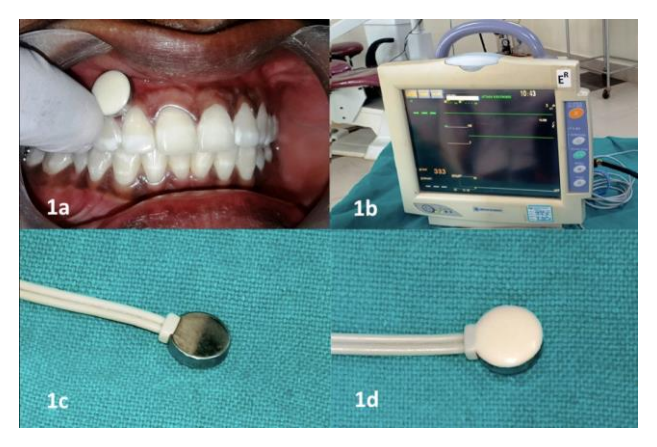
Figure 1. Measuring gingival surface temperature. 1a: Placement of the lead over the gingival surface. 1b: Monitor displaying the temperature. 1c, 1d: The lead used to measure the temperature.

To validate the accuracy of the GST compared with PISA in a better way, receiver operating characteristics (ROC) curve was used to assess sensitivity and