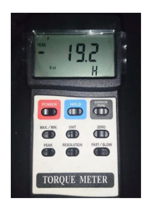
Figure 3. Controlling the load via a digital torque meter

According to the Tukey test results in Table 2, the difference in reverse torque values between saliva and tetracycline groups was significant (P<0.05). In addition, there was a significant difference between the salivary and chlorhexidine groups and between the tetracycline and