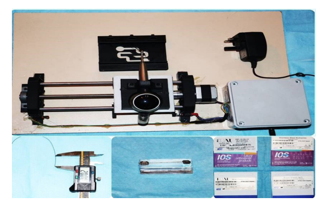
Figure 1. A customized holding device for air polishing, length of wire used, CNC block with wire attached to it, and archwires used

The wires were swiftly relocated to another tube filled with 10 mL of artificial saliva in seven days. Once again, after another seven days, the wires found a new home in a fresh tube, still containing 10 mL of artificial saliva. This meticulous process adhered to the esteemed ISO/