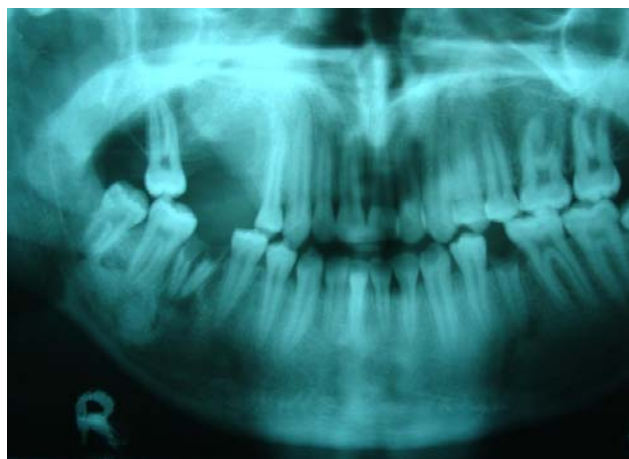
Figure 4. Panoramic view in one-year follow-up.