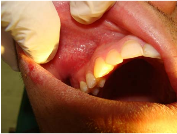
Figure 1. Intraoral view of the lesion that shows bony expansion on the buccal aspect of the premolar and molar region.

with a smooth, intact mucosa (Figure 1). All the molars and premolars of the quadrant involved were vital.