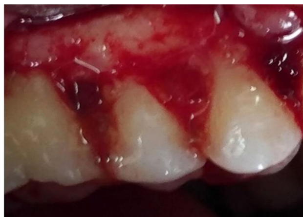
Figure 3. Defect zone containing metformin and PRGF.

Blood harvesting was performed a few minutes before surgery (10 mL). Each 4.5 mL of collected blood was mixed in sterilized tubes with 0.5 mL of 3.8% sodium citrate as an anticoagulant. The final preparation was centrifuged with a single-speed device at 460 g for 8 minutes (PRGF-Endoret System IV Biotechnology