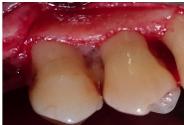
Figure 2. Defect zone containing PRGF.

prescription (amoxicillin, 500 mg, TID), the directions for oral hygiene (0.12% chlorhexidine, 5 mL, BID) and with the recalls schedule.