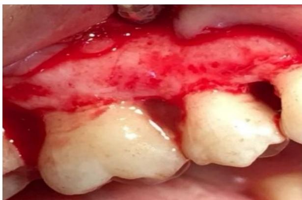
Figure 1. Defect zone containing metformin.