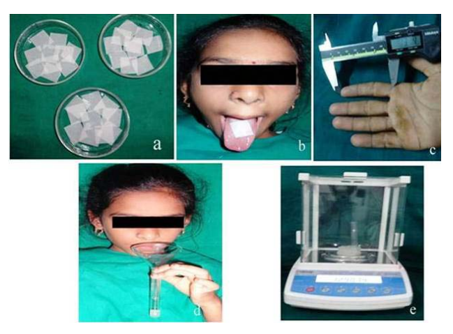
Figure 1. Whatmann filter papers dissolved in PROP solution (a). PROP strip placed on the dorsum of the tongue (b). Measuring the index digit length using digital Vernier callipers (c). Collection of saliva by spitting method (d). Weighing the device used for measurement of saliva (e).

Out of 500 children selected for study, two were excluded due to incomplete data. Among the 498 participants, 176(35.3%) of them were 9-year old, 164(32.9%) were 8-year old school children and almost equal gender wise distribution (Figure 2). When 2D:4D ratio was measured with Vernier calipers, majority (81.4%) had low 2D:4D ratio, only 15% of them had high 2D:4D ratio and very few (4.6%) had equal digit ratio. Among the males, 81.7% of them had low 2D:4D ratio, 12% had high 2D:4D ratio and remaining males had equal 2D:4D ratio; 79.6% of the females had low 2D:4D ratio, 18.2% had high 2D:4D ratio and 1.2% females had equal 2D:4D ratio ( (Figure 3a) Comparison between PROP sensitivity and gender was shown in Table 1, 140 out of 257 males and 111 out of 241 females were non tasters of PROP and the remaining were