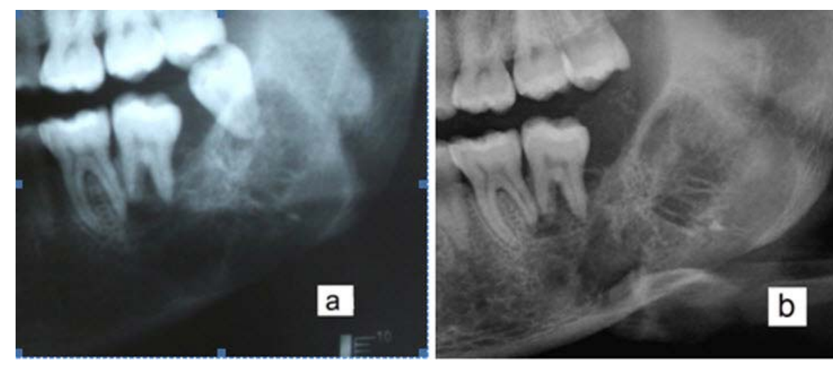
Figure 1. Cropped panoramic radiograph showed a mixed radiolucent/radiopaque lesion with a relatively well-defined border between the left mandibular first molar and ramus. Before extraction (a). Six months after the extraction of third molar (b). Tooth displacement and root resorption were also seen on the panoramic radiograph.

Conventional radiography is usually the first imaging modality to be performed and may reveal something from small periapical radiolucencies to large multilocular lesions. Tooth displacement and root resorption are more reliably observed by conventional radiography but CBCT appears more convenient and is useful for observing the maxillofacial lesion in detail. These pieces of information include