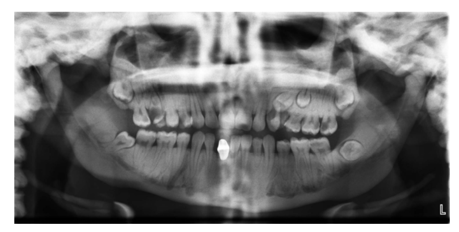
Figure 4. Panoramic radiograph of case 2 revealed generalized hyperdensity of the maxilla and mandible with multiple impacted teeth and carious lesions.

addition, the former anteroposterior (AP) and lateral views of the tibia and fibula demonstrated generalized osteosclerosis and multiple previous fractures (Figure 5, B).