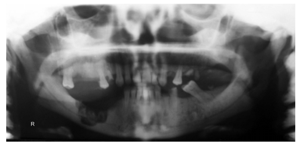
Figure 2. Panoramic radiograph of the first case three months later. Note the spread of osteomyelitis below the inferior alveolar canal and the presence of sequestra.