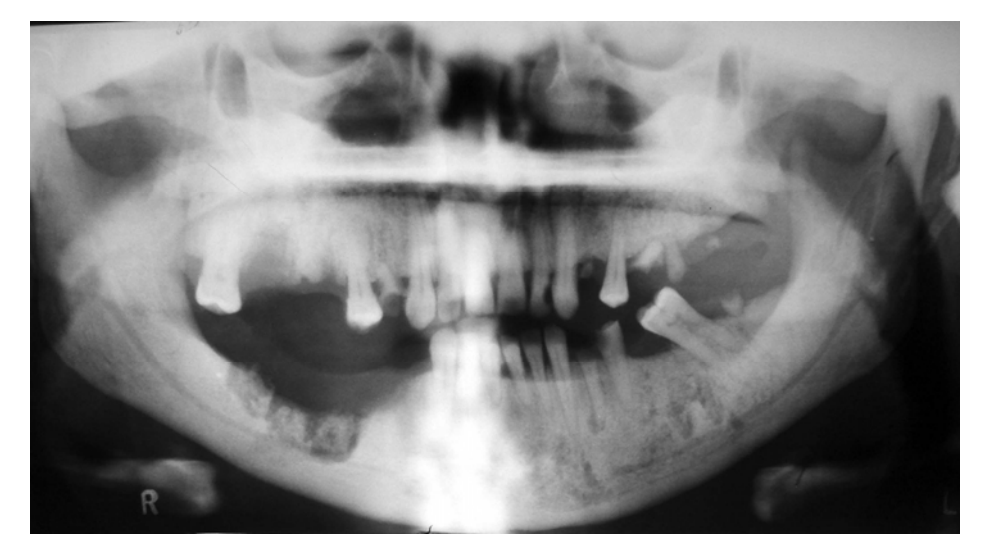
Figure 1. Panoramic radiograph of case 1, showing the intense maxillomandibular sclerosis and bony sequestrum on the right mandibular body.

A 25-year-old man, with a height of 153 cm, re-