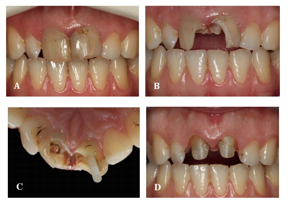
Figure 1. Maxillary central incisors with large composite restorations (A).Situation after removal of composite restorations (B). Fiber posts cemented to the prepared post space with dual polymerized resin luting agent (C). Situation after core build-up and tooth preparation (D).

The designing of the restoration was started from tooth #11 by setting the CEREC 3D v.3.8 software for a crown in the biogeneric mode. Titaniumdioxide powder (CEREC Powder; Vita Zahnfabrik, Bad Säckingen, Germany) was applied to the prepared teeth and surrounding gingival tissues as an optical imaging agent. Titanium dioxide has high a refractive index and ensures uniform scattering of the light. An optical impression was made with the digital camera of the CEREC 3D acquisition unit. In this case 5 images were sufficient to capture 6 anterior teeth. Optical images of the antagonist teeth were also made and the bite registration was recorded with buccal scanning technique. In this technique optical bite registration images were taken from the buccal direction with the teeth occluded in maximum intercuspal position. In the next step, manual alignment of the preparation and antagonist models with the buccal bite registration images were required (Figure 2A). The buccal bite registration image was dragged with the mouse approximately to the corresponding parts of the preparation and antagonist models. The software then recognizes similar surfaces and automatically articulates the models in maximum intercuspal position. Once the models are virtually articulated, the occlusal contact strength of the crowns can be adjusted digitally between -200 and +200 µm, where negative values mean disclu-