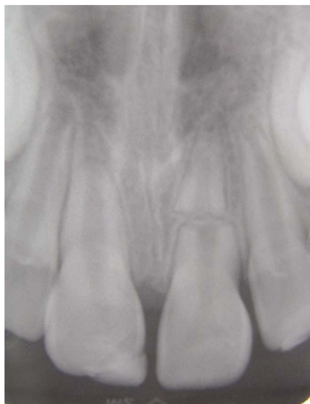
Figure 5. Radiographic image of the upper central incisors after 3 months and removing the splint.