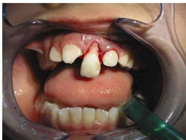
Figure 1. Clinical features of maxillary left central incisor.