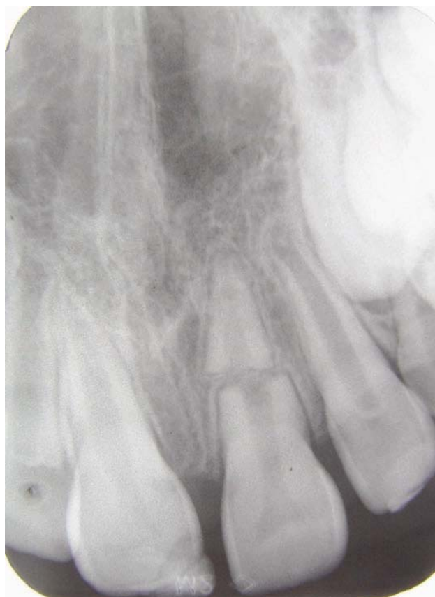
Figure 6. Radiographic image at 24-month follow-up, showing complete healing.

lutely necessary. In this case, the incisor was immature with a wide root canal and an open apex that favored pulp survival. Potential regenerative properties of the pulp in young permanent teeth such as in this case are worth waiting to obtain better healing of the root fracture.