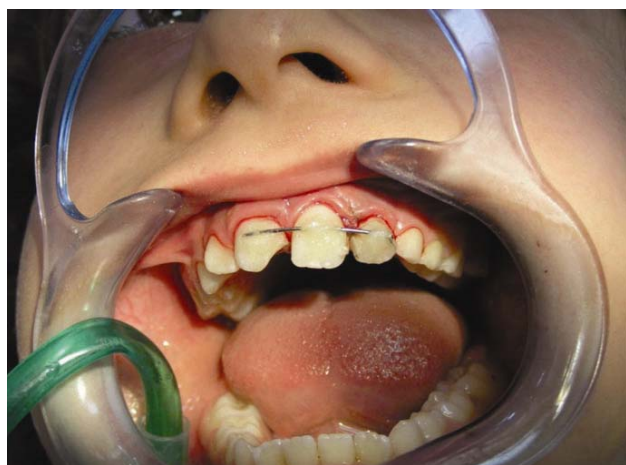
Figure 4. The splint was placed with stainless steel wire and fixed with light-cured composite resin.

In this case, referral time was an important factor. The displacement of the coronal part was so severe that favorable healing would have been compromised if the tooth had not been repositioned at the initial examination. Along with appropriate management, careful follow-up of trauma cases is abso-