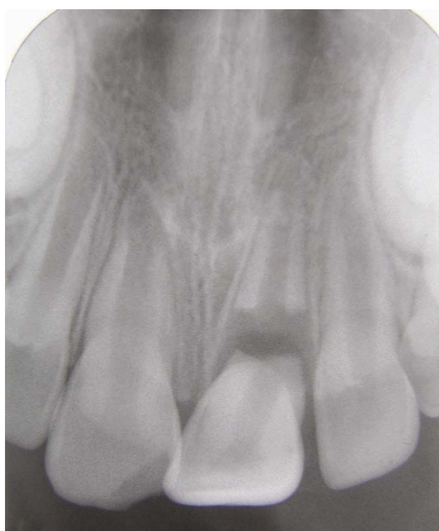
Figure 2. Radiographic image of the upper central incisors.

illary teeth underwent vitality tests. All the mandibular teeth responded to electric pulp tester (Vitality Scanner; Sybron Endo, Boston, MA) and cold test. The immediate treatment plan comprised reduction with gentle digital manipulation, repositioning and splinting of the coronal fragment under local anesthesia (2% lidocaine with 1:100000 epinephrine). Before splinting, for checking the optimal repositioning of the coronal fragment, the left central incisor was fixed to the left lateral incisor with composite resin (Figure 3a) and a radiograph confirmed proper coronal fragment repositioning (Figure 3b).