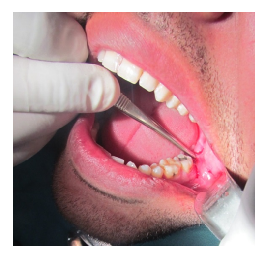
Figure 3. Triangular transposition flap (TTF) covers the wound created after surgical removal of wisdom tooth in the mandible and participative in primary wound healing.

This results of the this study showed that TTF can reduce dehiscence rate, more than the envelope flap. after wisdom tooth removal in mandibular mesioangular class IB impactions. TTF cannot completely prevent dehiscence due to the inherent nature of the surgical field with an unsupported soft tissue wound. Not all dehiscence cases will prompt the patient to refer to the dentist. A large dehiscence has more chance of being self-cleaning but in a small dehiscence, entrapment of food and bacterial fermentation products bother the patient. This explains why primary wound closure after removal of mandibular third molar leads to more pain and trismus in comparison with secondary healing, in which the surgeon intentionally creates 5-6 mm of gap in the mucosa distal to the mandibular second molar. The surgeons prefer to confront with an established large and selfcleaning dehiscence, rather than wound breakdown after closure of soft tissue flap under tension that might lead to small dehiscence. Tension-free primary wound closure without subsequent breakage can pro-