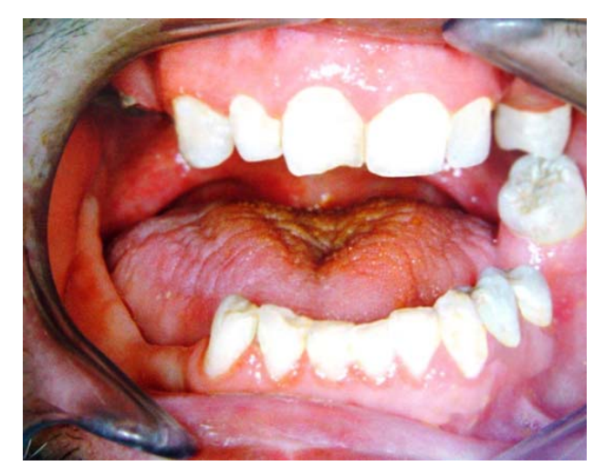
Figure 1. Intraoral view shows anterior open bite.

bring the condyles into their appropriate position. Therefore, bilateral vertical osteotomies were carried out and the mandible was guided to the normal occlusion. Intermaxillary fixation was applied with arch bars after removing the throat pack and kept for 10 days; subsequently, active mouth opening exercises were ordered. Proximal and distal segments were checked and the incisions were closed in three layers.