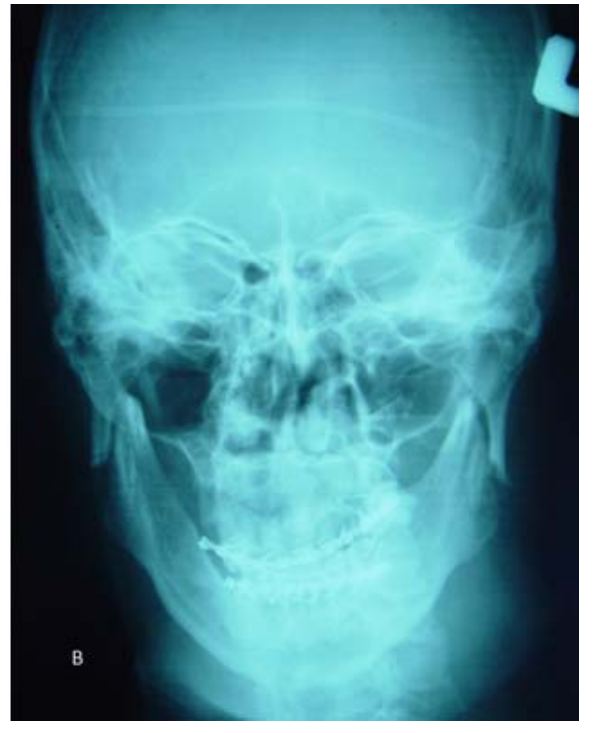
Figure 6. Postoperative PA view of the mandible shows relationship between the bone segments.

which might fracture the jaw or threaten vital structures. Treatments such as eminectomy or use of miniplates and screws in the articular eminence are usually used when the condyle head is reducible.<sup>5,10</sup> The former treatment permits free movement of condyles and the latter limits the forward extrusion. Minzuno et al<sup>5</sup> treated two patients with LCD using eminectomy.