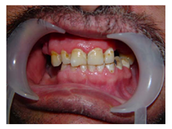
Figure 4. Postoperative view one year after surgery shows acceptable occlusion.