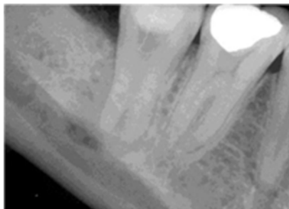
Figure 3. Radiographic image taken after placement of intracanal medication at the end of first visit.

droxide paste with normal saline was placed as an intracanal medicament with a lentulospiral and the access cavity was sealed with a temporary filling material (Cavisol; Golchai CO., Tehran, Iran; Figure 3). Incision and drainage was performed in the same session.