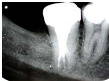
Figure 5. Radiographic evaluation of treated tooth at 18-month follow-up. The periapical radiolucency has disappeared. The patient is asymptomatic.