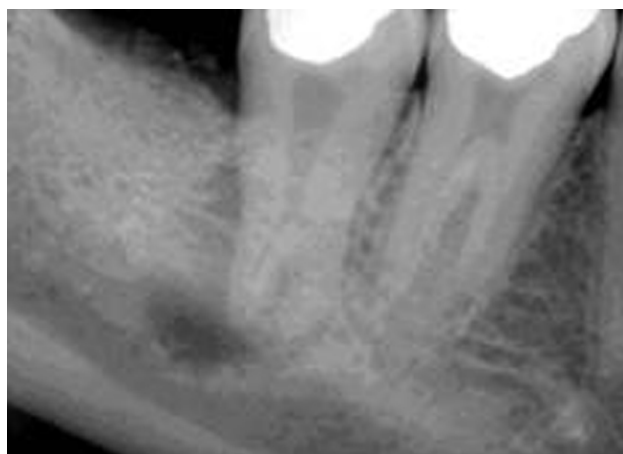
Figure 1. Preoperative radiograph of right mandibular second molar with hypertarodontism and periapical radiolucency.

epinephrine (Daroupakhsh, Tehran, Iran), the tooth was isolated with a rubber dam and access cavity was prepared. Detection of the root canals deemed difficult and was performed with an endodontic microscope (OPMI Pico Dental Microscope; Zeiss, Oberkochen, Germany). Four root canals were detected. Working length was determined with an electronic apex locator (Raypex 5, VWD GmbH, Munich, Germany) and confirmed with k-files (Dentsply-Maillefer, Ballaigues, Switzerland) and radiography (Figure 2).