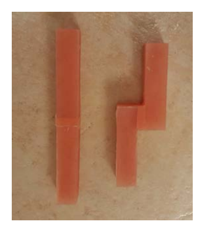
Figure 4. The model on the right for shear bond strength test and the model on the left for tensile bond strength test.