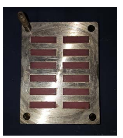
Figure 1. Special mold for manufacturing the acrylic blocks.

The samples were immersed in distilled water after they were prepared. One-third of the samples was immersed in 2.5% sodium hypochlorite solution once a day for 15 minutes and another one-third in Corega solution for the same period. This continued for 20 days. The remaining one-third of the samples was considered the control group.