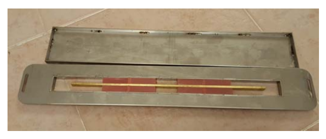
Figure 2. The placement of the samples in the mold for both the tensile bond strength tests.

Data were analyzed with one-way ANOVA and descriptive statistics (means \pm standard deviations), using SPSS 16.0 (SPSS Inc., Chicago, USA). Statistical significance was set at P<0.05. Post hoc Tukey tests were used for two-by-two comparisons of the