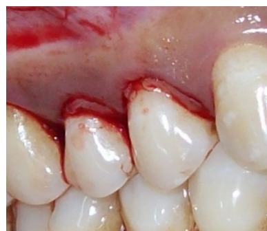
Figure 2. Incision; the control group.

The results were averaged (mean \pm SD) for each clinical and radiographic parameter at baseline, 6-week, and 6-month