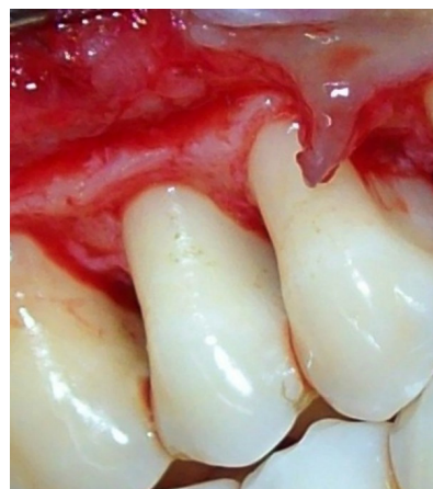
Figure 3. Flap reflection and debridement; the control group.