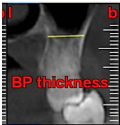
Figure 2. the buccopalatal thickness in the area superior to the apex of the first molar

SPSS 22 was used for the analysis of data, with Pearson's correlation coefficient, Tukey test and regression analysis. Intra-group differences between