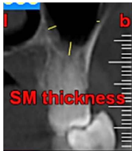
Figure 4. the thickness of the schneiderian membrane

the parameters of the present study were analyzed with Tukey test and ANOVA. In addition, Pearson's correlation coefficient was used to analyze the relationship between the two variables. Furthermore, regression analysis was used to analyze the relationships between the variables.