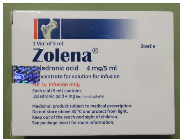
Figure-1. Zolena, 4mg/5ml, Ronak Daroo, Iran.

The three groups consisted of: (1) negative control group, (NC): rats that did not receive any orthodontic appliance and were only anesthetized, (2) positive control group (PC): rats that received orthodontic appliances for their maxillary arch. These rats received 0.01 cc of 0.9% sodium chloride injectable solution (Therapeutic and Injectable Products Company, Tehran, Iran) injected into the vestibule of the mesial root of their maxillary first molars. 3) ZA group (Z): 0.01 cc (approximately 0.02 mg) ZA (Zolena, 4mg/5mL, Ronak Daroo, Iran) was diluted by 0.9% sodium chloride injectable solution (Figure 1) and injected into the vestibule next to the mesial root of the maxillary first molar by a blind operator.