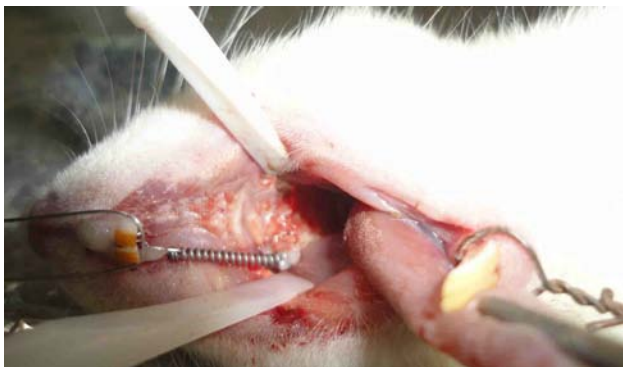
Figure 2. Intraoral view of orthodontic appliance which place between first molar and central incisors.

feeler gauge, FENGHGO) with 0.05 mm accuracy. The mean of the three measurements was reported as the final value.