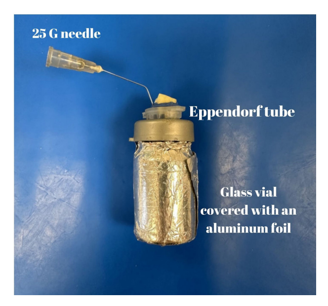
Figure 2. Experimental model system used to evaluate debris extrusion

in samples initially prepared up to F3 files than in samples prepared up to PTU F4 files when filling materials were removed without a solvent (P<0.05).