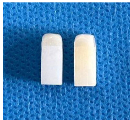
Figure 1. Porcelain veneered zirconia blocks: (right) multilayer; (left) monochromatic

Each block was then mounted in acrylic resin (Acropars 200; Marlik, Tehran, Iran). The SBS of zirconia to porcelain was measured in a universal testing machine (STM20; Santam, Iran). 18 Load was applied to the zirconia-porcelain interface by a chisel at a speed of 1 mm/minute. The exact location of the interface was first marked by a marker. The load was applied until the porcelain was debonded from zirconia, and the magnitude of force causing debonding was recorded. The SBS was measured by dividing the load at debonding by the surface area.