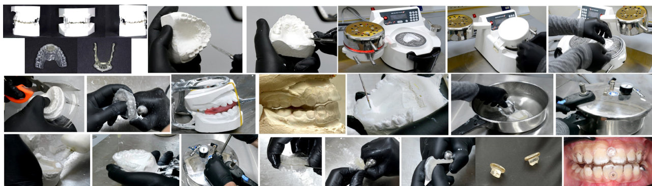
Figure 2. Fabrication process of appliances by an orthodontic laboratory

undercuts were relieved on the cast. The compact pressure molding unit (MINISTAR S, Germany) was used to compress the polyethylene sheets. The excess thermoplastic material was cut with scissors, and the appliance was finished and polished. The working casts were mounted with an Exacto-Bite on a simple hinge articulator. After that, the acrylic parts were added, beginning with the lower member to make the guiding surface and extension lingual arms. The cast and the appliance were immersed in water under pressure to eliminate extra air bubbles from the acrylic resin. Then, the lower member of the appliance was finished. On the other hand, the acrylic part was added to the upper member to build the advancement bar after adding a wax coating to the surface of the lower member. The appliance's upper and lower members were placed in water under pressure. A straight contra was used to finish and polish the HAF appliance. The buttons were constructed from white acrylic resin and added to the appliance using self-cured acrylic resin.