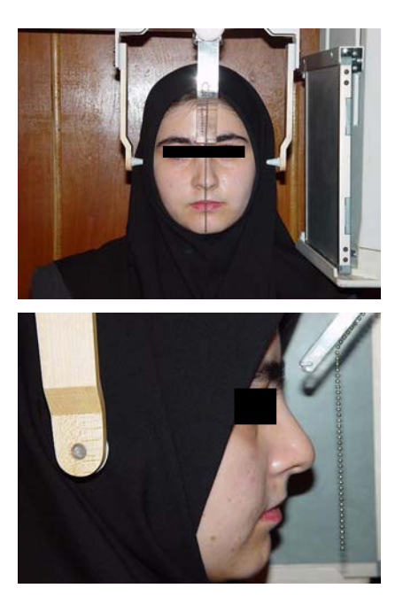
Figure 1. Method of registration of cephalograms in NHP.

All subjects signed the form of ethical approval indicating their voluntary decision to participate in this study. Lateral cephalograms were taken with the teeth in centric occlusion, lips in repose and the head oriented in natural position according to Mooreese.<sup>6,13</sup> Then ear rods and frontal head holder were put passively without any force