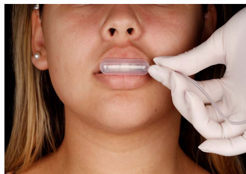
Figure 3. Lip pressure assessment

connected to a flexible plastic tube, which is attached to a device with an air bulb. 15 During the assessment, the individual remained seated with a back support, while the air bulb was positioned transversely between the lips (Figure 3). They were then instructed to exert maximum lip pressure on the bulb for 4 seconds, followed by a 30-second rest interval. The procedure was performed three times. The recorded lip pressures were compiled, and the average of the obtained values was calculated using specialized software (PLL Pró-Fono).