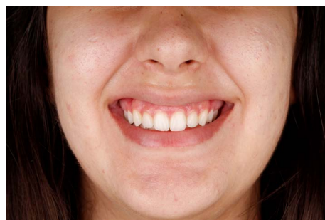
Figure 1. Gummy smile

Individuals underwent lip pressure measurement, expressed in kilopascals (kPa), using the Biofeedback Pró-Fono device – Lip and Tongue Pressure Measurement (PLL Pró-Fono), an instrument validated by the Brazilian National Health Surveillance Agency (Anvisa). The device consists of a pressure sensor connected to an electronic board, both housed in a plastic casing. The sensor is