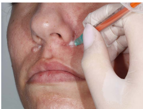
Figure 2. Aesthetic protocol