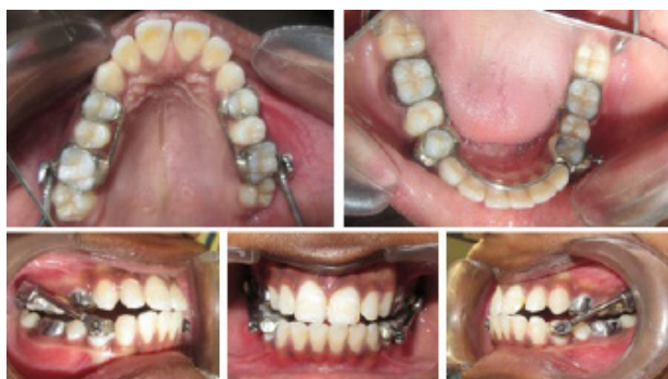
Figure 3. Intraoral photographs at T1, depicting partial anchorage in the upper arch and total anchorage in the lower arch.