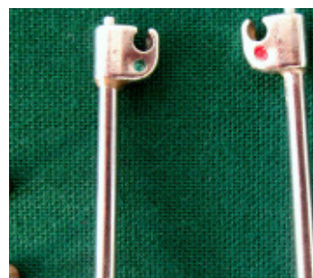
Figure 5. Components of the Flip-Lock Herbst appliance with the ball connectors, plungers, and scribe to distinguish red and left.

The OL and the OLp from T1 lateral cephalogram were used as a reference plane and transferred to T2