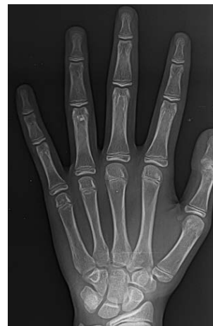
Figure 2. Hand wrist radiograph to determine growth status.