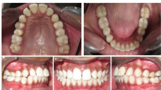
Figure 4. Intraoral photographs at T2, depicting the end of functional phase.

the upper first molars and lower first premolars. The framework was cemented to the upper and lower arches. The tube was connected to the upper ball joint member. Right and left sides were distinguished by red and green dots scribed on the upper head of the tube (Figure 5). The plunger length was measured and cut in accordance with the advancement needed to achieve class I molar relation. The plunger was inserted into the tube, and the patient was asked to advance the mandible so that the plunger end could be fitted onto the ball joint connector in the lower first premolar. The tubes and plungers were fitted onto their respective ball joint connectors, and the snap fit was established. For the first month, patients were reviewed once a week. From the next month onwards, they were reviewed once a month. Changes in molar relationships were monitored during the monthly reviews by removing the plunger and tube. When a class I molar relationship was achieved, the appliance was removed, and records for T2 were taken.