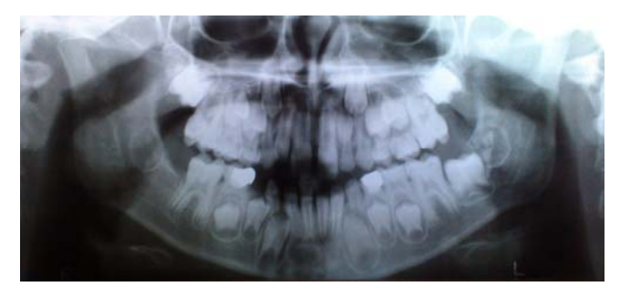
Figure 5. Panoramic radiograph 3 years after surgery.

in the differential diagnosis of radiolucent lesions of both jaws in all age groups. 9-11 According to the radiographic feature, site, and consistency of lesion in the present case, the differential diagnosis was odontogenic myxoma, mural ameloblastoma and infected odontogenic cyst. 12 However, according to the pathological findings of the case, final diagnosis was odontogenic fibromyxoma accompanied with odontogenic cyst.