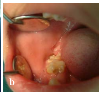
Figure 1. Extra-oral photograph showing a swelling in the right side of mandible (a). Intra-oral photograph showing an expansion in buccal and lingual cortex of right angle of mandible (b).