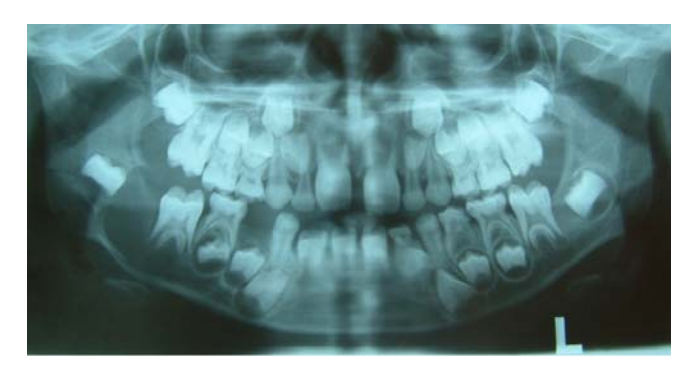
Figure 2. Panoramic radiograph showing a well-defined, unilacullar radiolucency around mandibular right second molar as well as a multilacullar radiolucency extending from distal of mandibular right first premolar to the mesial of mandibular right second molar.

during the surgery sent for pathological examination to reveal whether the lesion is benign or malignant and the margins are free of lesion or not. After several frozen sections, clear bony margins were reached to prevent recurrence of the neoplasm. Mandibular right second molar was also extracted. Pathologic lesion involved a neurovascular bundle (inferior alveolar nerve) that was separated meticulously from the lesion.