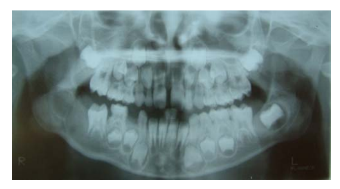
Figure 4. Panoramic radiograph 4 weeks after surgery.