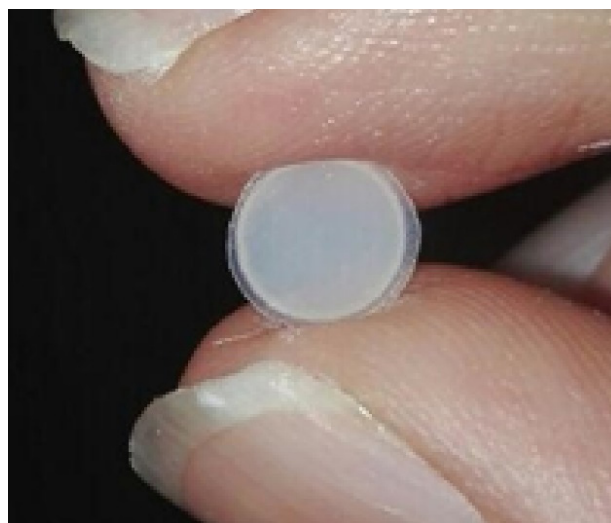
Figure 1. Composite resin disk.

To prepare bacterial suspensions, S. mutans (ATCC 25175), S. sanguis (ATCC 10556), and L. acidophilus (ATCC 4356) were used. All the bacteria were grown in brain-heart infusion broth (BHI; Difco, Sparks, MD, USA) at 37°C until the cells reached the mid-logarithmic phase (optical density=600 nm, 0.5 for S. mutans and S. sanguis , and 1 for L. acidophilus ). L. acidophilus was grown under anaerobic conditions, and the two other bacteria were grown under aerobic conditions in the presence of 5% CO 2 .