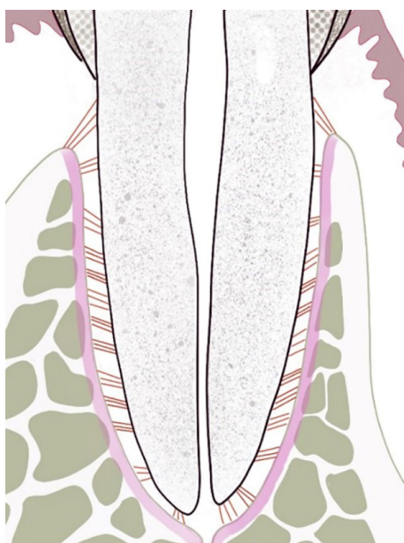
Figure 2. Schematic diagram of the basic structure of periodontal tissues.

of the cementum, which is called cementoid. Through deposition, the cementum gradually thickens, forming a lamellar structure. The function of the cementum is to combine the periodontal tissues with teeth through Sharpey's fibers and repair root surface damage through the deposition of cementum. 13