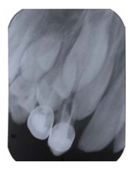
Figure 4. Periapical radiographs after treatment of canines.