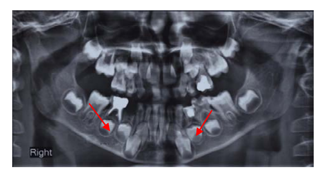
Figure 2. Panoramic view of the patient.

(Figures 1 & 2). The bifurcation was located at the lower third of the roots, with mesiodistal apical divergence. This divergence was particularly pro-