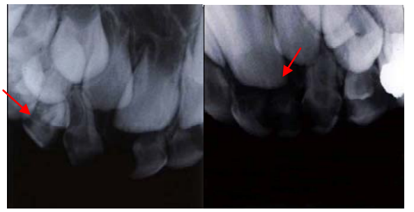
Figure 1. Periapical radiographic view of the double-rooted maxillary primary canines.