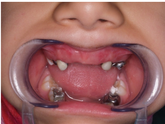
Figure 3. Intra-oral photographs of the patient.