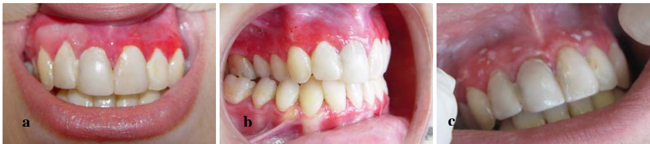
Figure 2. Comparison of surgical side (maxillary right quadrant) with medication therapy side (maxillary left quadrant) (a); Recurrence of desquamation (b); Oral candidiasis (thrush) following Fluocinonide therapy (c).

Treatment of oral lichen planus patients with desquamative gingivitis by use of free gingival graft is an aggressive therapy but more effective, with fewer