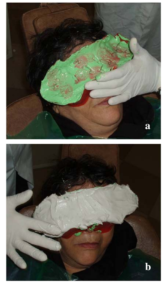
Figure 2. A direct impression (a) along with reinforcement by dental plaster (b) was applied.