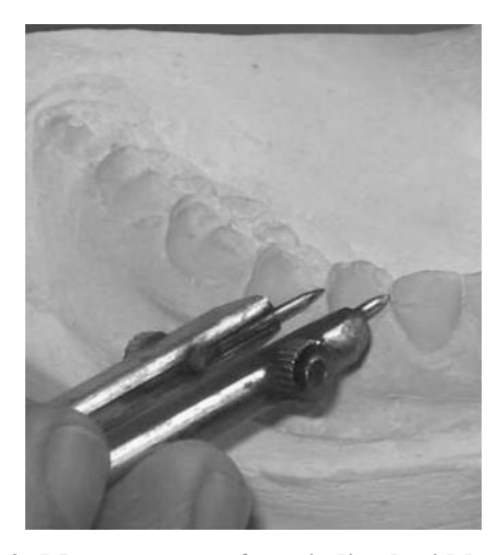
Figure 2. Measurement of mesiodistal width of mandibular canine on plaster models.