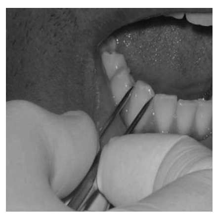
Figure 1. Measurement of mesiodistal width of mandibular canine by clinical examination.

Data was subjected to statistical analysis using ANOVA.