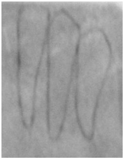
Figure 3. Measurement of mesiodistal width of mandibular canine on tracings of intraoral periapical radiograph.